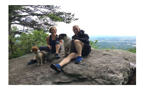
A WORD FROM OUR PASTOR

A Word from our Pastor Stewardship Letter Pledge Card Page 1 Leadership Team Update Page 3 November Sermon Series Page 3 Blessing of the Animals Page 4 Missions Page 4 Baptisms on 11/20/22 Page 5 Appreciation Page 5 Page 5 Needed! Fall Work Day Page 5 Brookeville Sing and S'more Page 6 Fall / Winter Bible Study Page 6 Reading Room Page 6 Page 6 Musical Instruction Appalachia Service Project Page 6 Page 7 Giving Birthdays Page 8 Contacts Page 8