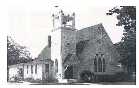
SALEM Methodist Protestant Church 1833