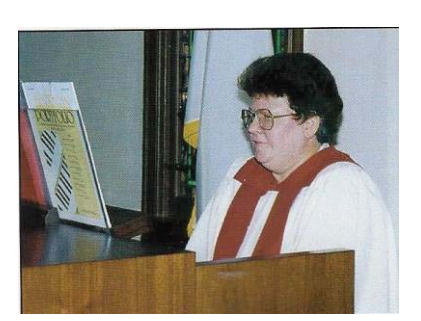
From the 1998 Salem Directory