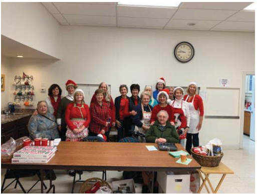
The Faithful Workers

Salem's Annual Christmas Bazaar was another success!