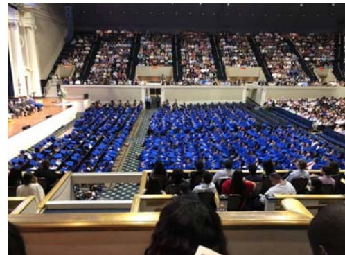
Sherwood High School Class of 2019