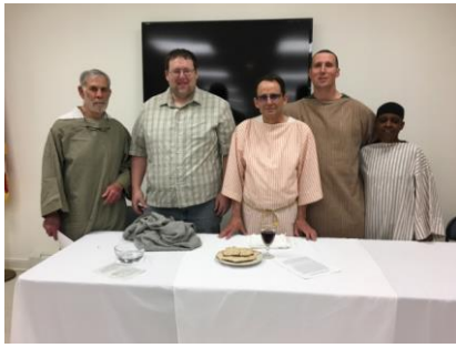
Jesus with his Disciples