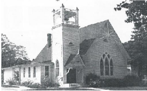
SALEM Methodist Protestant Church 1833

“184 Years and Still Loving, Serving and Celebrating”