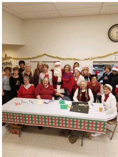
Faithful Bazaar Workers

In addition to creating Christmas for others, the women earned nearly $5000 in only four hours. Well done, good and faithful Salem servants!