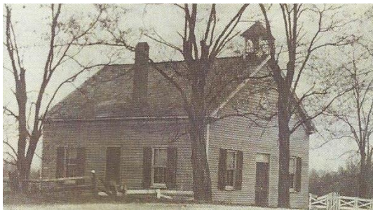
SALEM Methodist Protestant Church 1833

«184 Years and Still Loving, Serving and Celebrating»