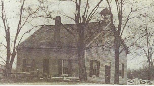
SALEM Methodist Protestant Church 1833

“185 Years and Still Loving, Serving and Celebrating”