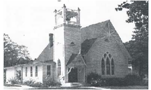
SALEM United Methodist Church 2018

12 High Street, Brookeville, Maryland 20833