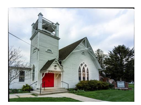
SALEM Methodist Protestant Church 1833