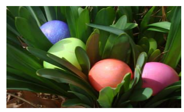
Salem's annual Easter Egg Hunt will be held at 9:30 am to 10 am at the Community Hall.