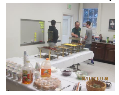
Last minute check

February 11<sup>th</sup> found our ASP Team busy preparing breakfast for the Congregation's enjoyment and to raise funds for their trip.