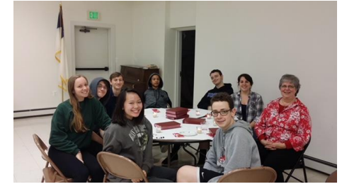
Our Youth breaking their fast with Holy Communion

Their presentation and effort was great, they broke their fast upon returning to the Community Hall, where there was Holy Communion and a spaghetti dinner waiting for them. Good job Young People, we are proud of you.