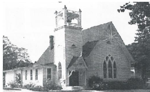
SALEM United Methodist Church 2017

12 High Street, Brookeville, Maryland 20833