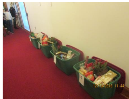
Previous year's baskets

Once again, as part of an ecumenical effort led by St Peter's Catholic Church, we will be creating four gift baskets for the Christmas holidays. These baskets will be distributed to families that are struggling financially and live in the Olney area.