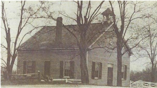
SALEM United Methodist Church 2016

«183 Years and Still Loving, Serving and Celebrating»