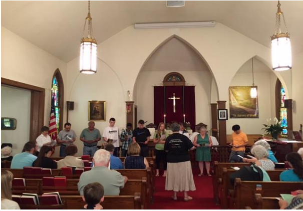
The Consecration of the ASP Team