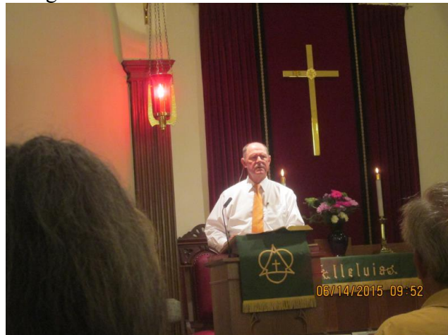
This picture is from an earlier visit.