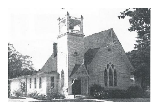
SALEM United Methodist Church 2016