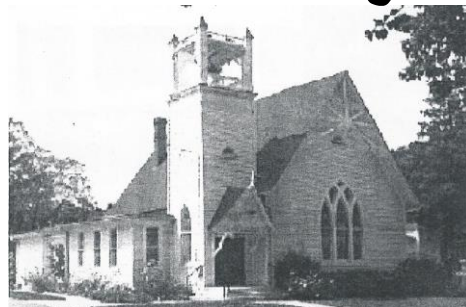
SALEM United Methodist Church 2015

12 High Street, Brookeville, Maryland 20833