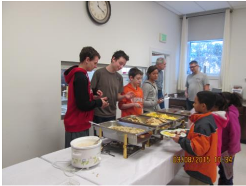
ASP Members serving Breakfast

Finally, our ASP teams were able to have their February Fundraiser on March 8 th . There was a very good turn-out and as always the food and service were great. Thank you to all who helped prepare the food and to all who helped consume it. Your donation will go a long way in helping our three teams make it to Kentucky the week of June 28 – July 4. There are two more scheduled Fund raisers - please come out and support the Salem ASP teams.