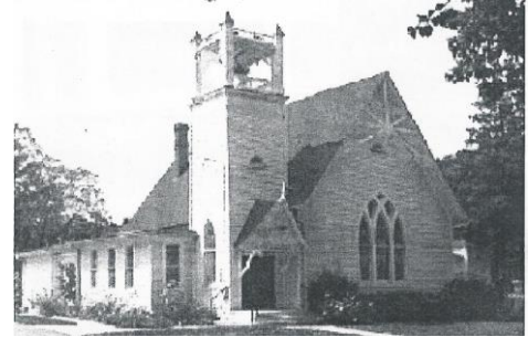
SALEM United Methodist Church 2013

12 High Street, Brookeville, Maryland 20833