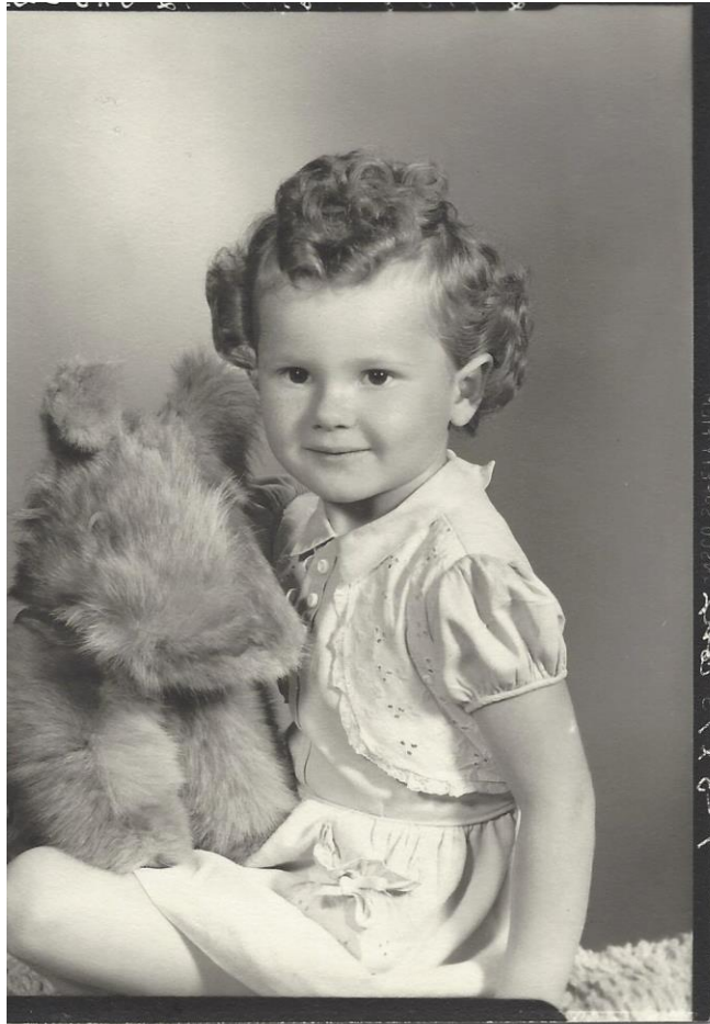
Isn't she beautiful? But who is she?