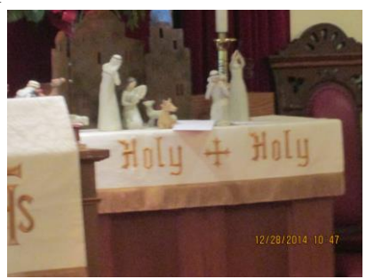
The letter of thanks on the Altar.

She suggested that together they write a letter to God thanking Him for His great gift. With the children's help she wrote the letter and the children placed it on the alter.