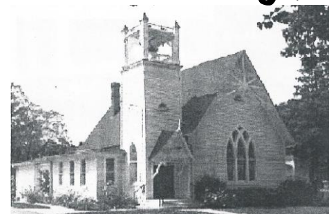
SALEM Methodist Protestant Church 1833