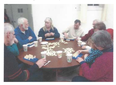
One of the many game tables.

After dinner the youth held their "Game Night" and invited everyone to join them.