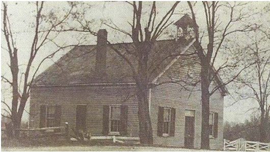
SALEM Methodist Protestant Church 1833

◀ 180 Years and Still Loving, Serving and Celebrating ▶