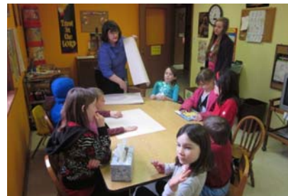
Learning about Burkina Faso, West Africa