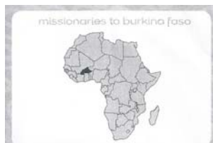
Shaded area is where the Hochs are working