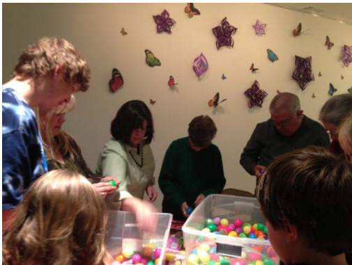
All hands busy at work.

We then played a card game that gave us insight into the Irish lore and our faith. When the games were over, we joined our efforts to prepare the plastic eggs for the Easter Egg Hunt.