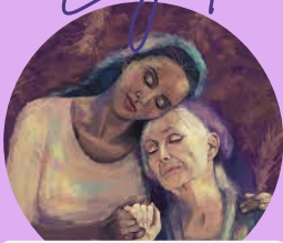
Ruth Ruth 1:1-18