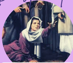
Bleeding Woman Luke 8:40-54