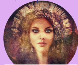
Vashti Esther 1: 10-19