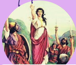
Deborah Judges 4: 4-10