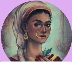
Mary John 20:1-18