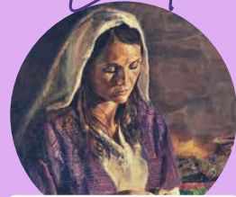
Tabitha/Dorcas Acts 9:36-42