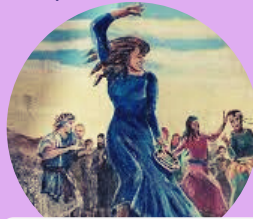
Miriam Exodus 15: 20-27