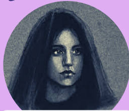
Hagar Genesis 16: 1-13