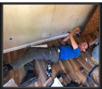
SERVICE PROJECT ®